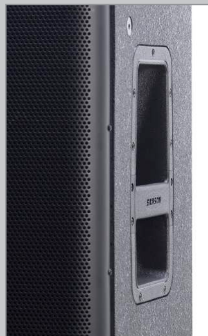
Integrated carry handle