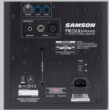
Resolv RXA5 rear panel