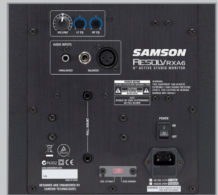
Resolv RXA6 rear panel